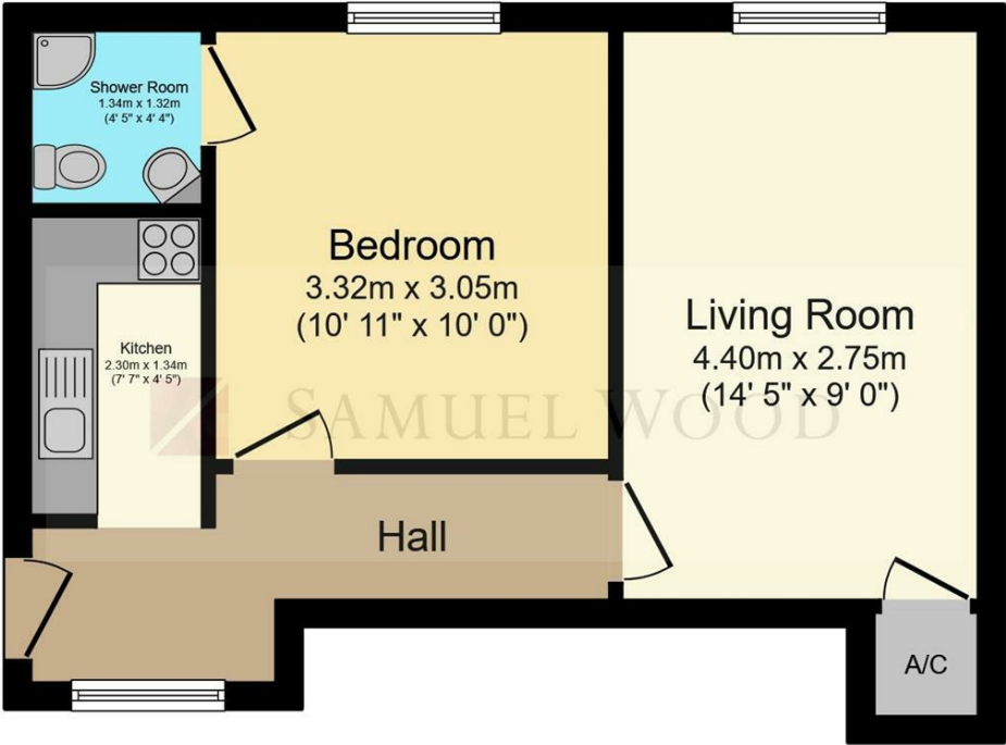
Floor Plan Floor area 34.1 m 2 (367 sq.ft.)